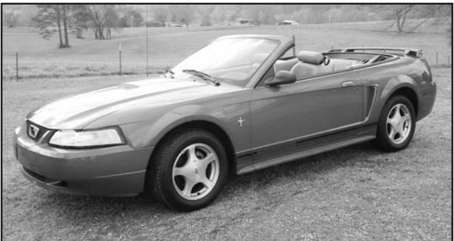
Blairsville Cruisers Raffle Car